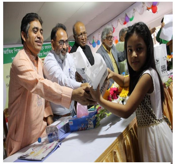
Chairman and Principal distributing gifts to the winner at the drawing competition