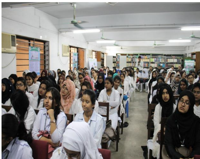
Participating students at the Workshop on Environmental Awareness