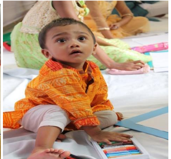
Little kid attending the drawing competition arranged to celebrate the National Children's Day