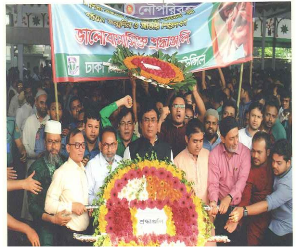
Dhaka City College is paying homage to the Father of The Nation on national mourning day