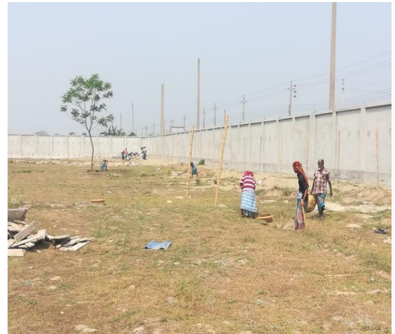
Construction work of Boundary wall of the land at Purbachal