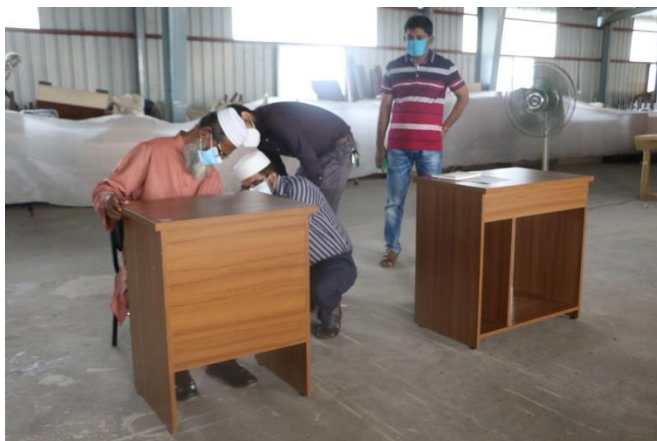
Nadia Furniture Factory Visit before procurement