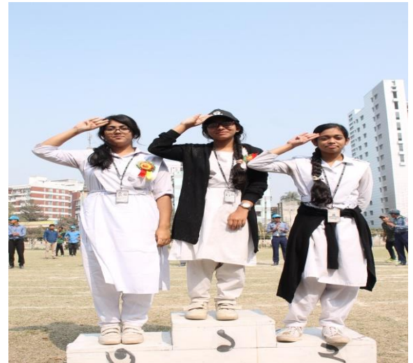
Winners of an event are saluting the audiences on the annual Outdoor Games competition