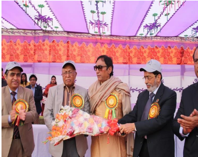
Honourable Chairman and Principal welcoming the guests on the annual Outdoor Games competition