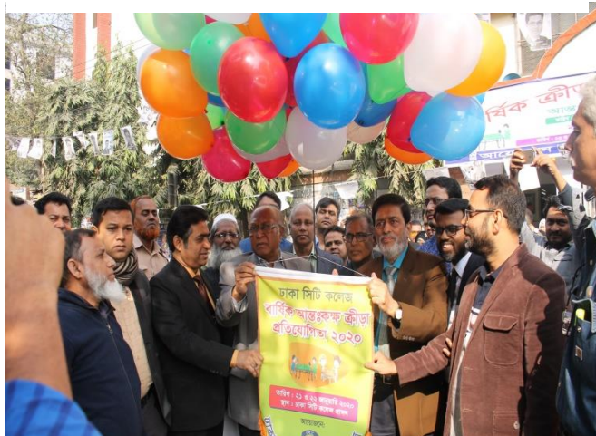
Opening ceremony of the annual Indoor Games Competition