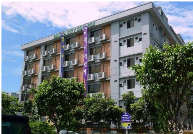
Outer view of the Dhaka City College Building