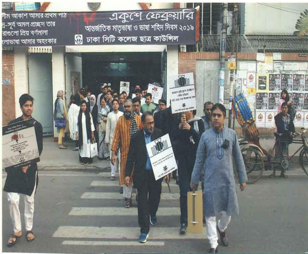
Observing International Mather Language Day