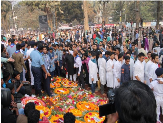
Dhaka City College is paying tribute to the National Shahid Minar on International Mother Language Day