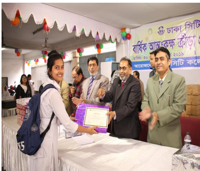
Prizes are distributed to a winner student on the annual Indoor Games Competition