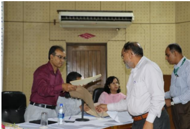
IDG CEDP Contract Signing Program