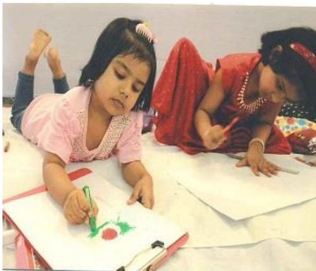
Children participating the National Children Day