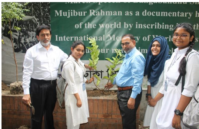
Dhaka City College is celebrating the National Tree Plantation Week