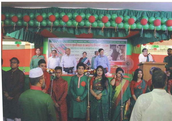
Guests and students are presenting National Anthem in unified voice