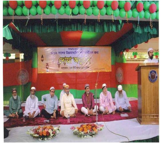
Guests and teachers at the annual Milad Mahfil