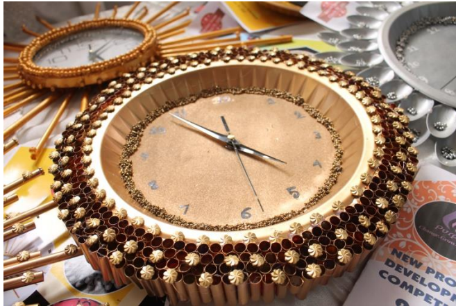
Students' Innovation on New Product Development Competition