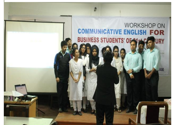
Participating students at the Workshop on Communicative English for Business Students