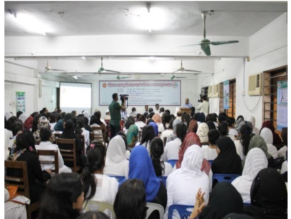
Participating students at the Workshop on Environmental Awareness