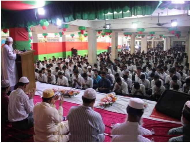
Students attending the annual Milad Mahfil