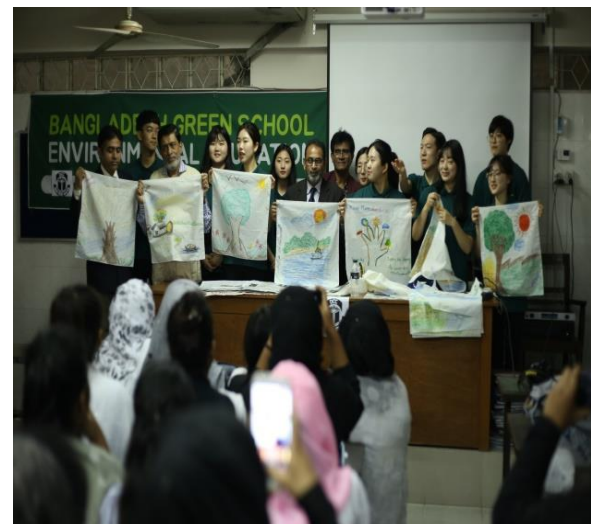
Students participating on Green School Campaign