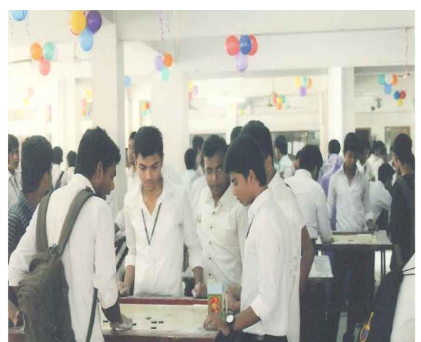
Students enjoying the annual Indoor Games Competition