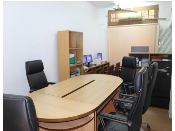
Dhaka City College IDG Sub-project office