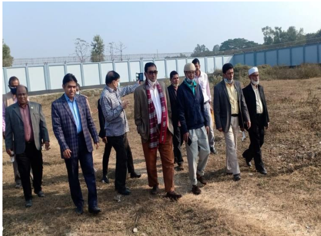
College authority visits the newly acquired land in Purbachal