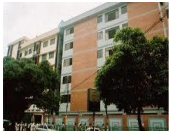
Outer view of the Dhaka City College Building