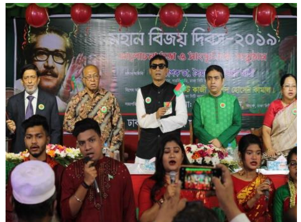
Guests and students are presenting National Anthem in unified voice