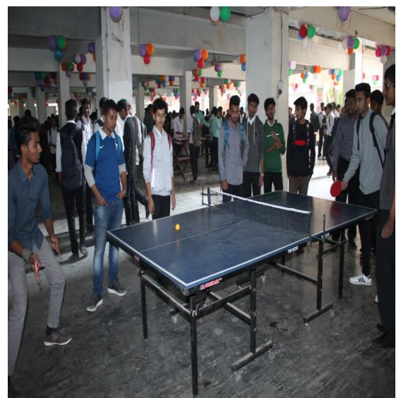
Students enjoying the annual Indoor Games Competition